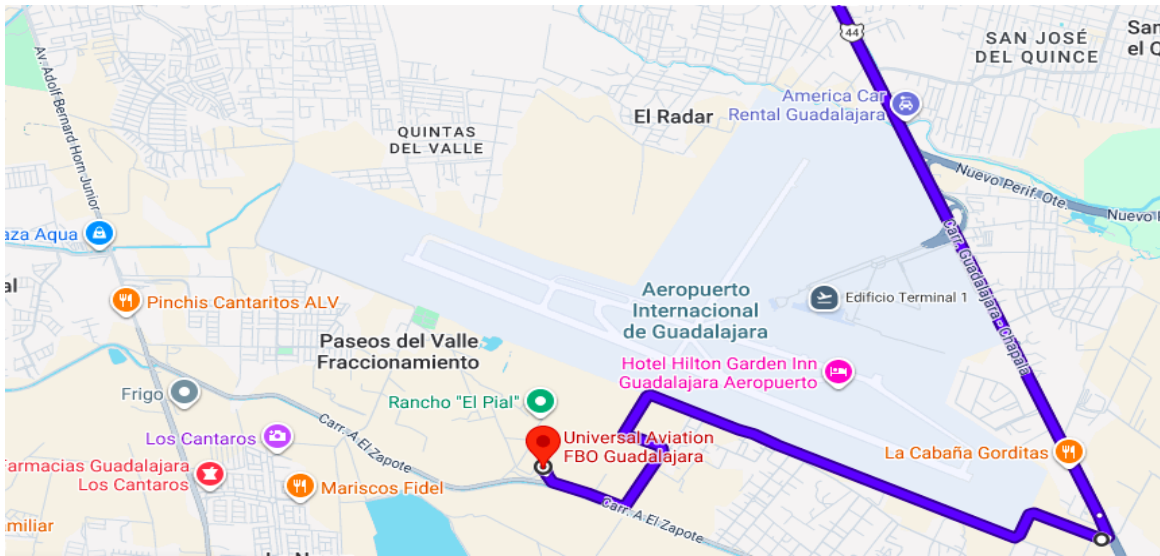
Route 2: Via Av. Adolf Bernard Horn Junior through Access Point 15.